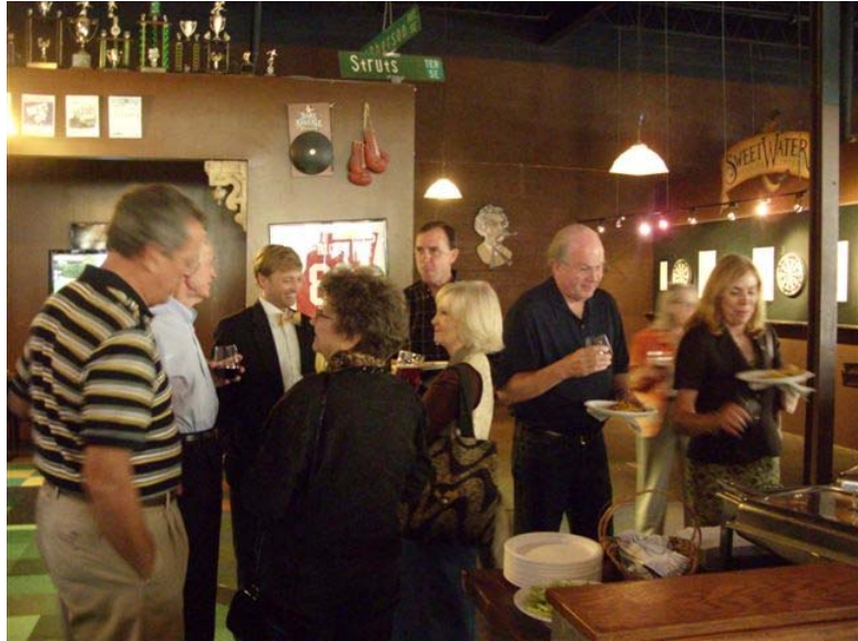
A photo from our First Thursday Rotary Social, held October 7, 2010 at Twains in Decatur.