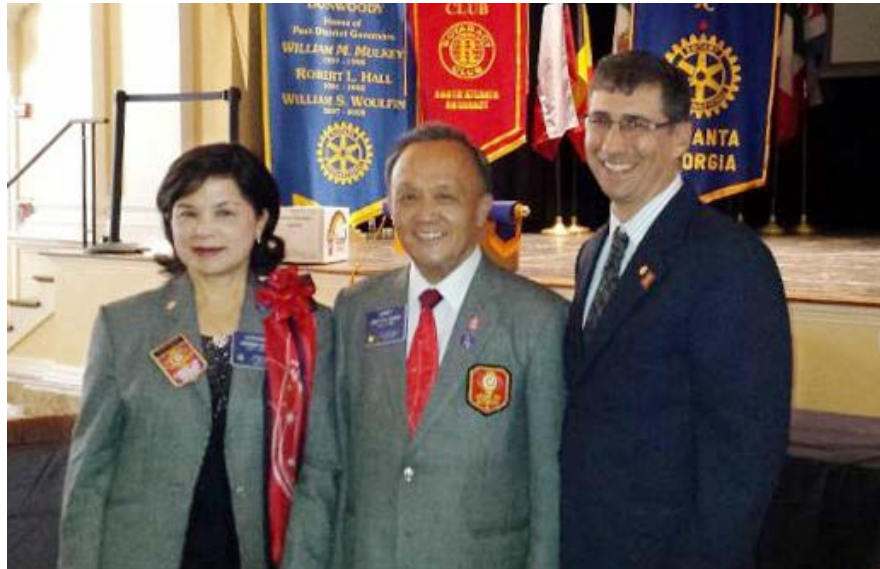
The Rotary Presidents