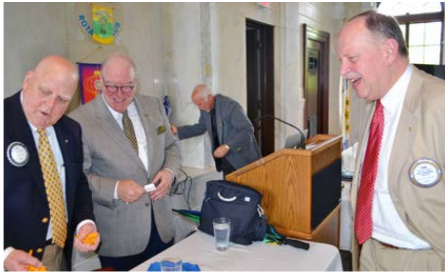
Rotary members visit with the speaker after the meeting.