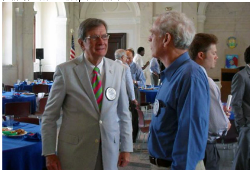
A Courthouse Moment perhaps?