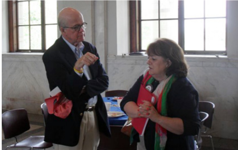
Maybe we should do it this way...