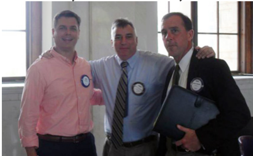
The Three Musketeers?