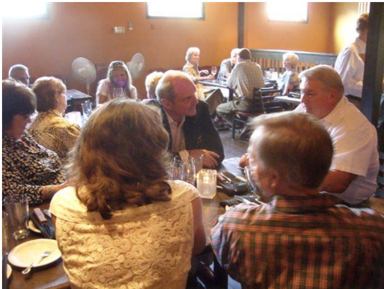
We had a great turn out for the First Thursday Rotary Social!