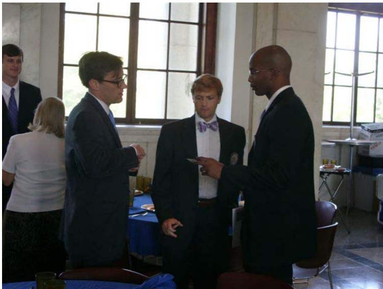
Networking after the meeting